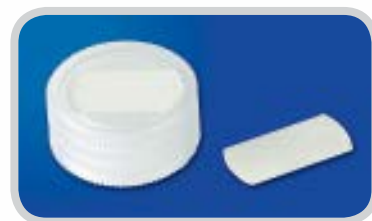
Recessed closure with Nomex® tab (tabs sold separately)

V = Conical Interior U = Rounded Interior